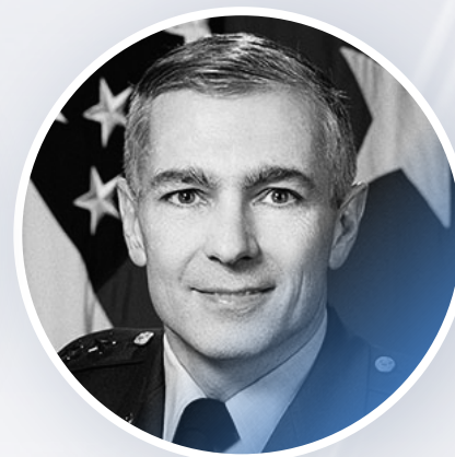
General Wesley K. Clark