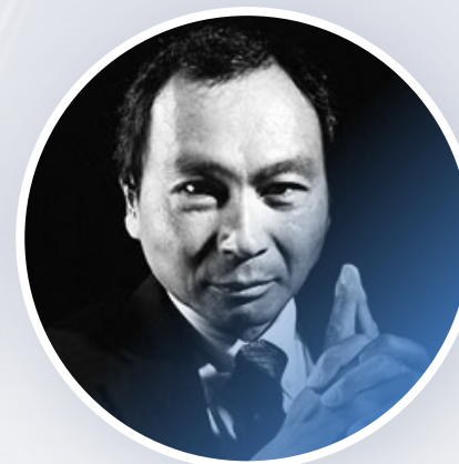
Dr. Francis Fukuyama