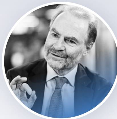
Timothy Garton Ash