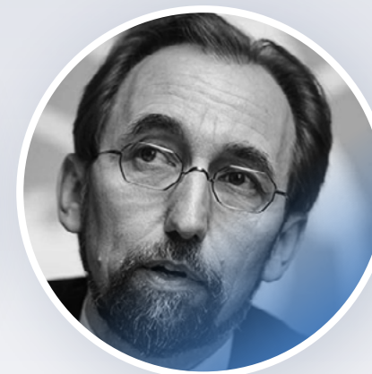
Zeid Ra'ad Al Hussein